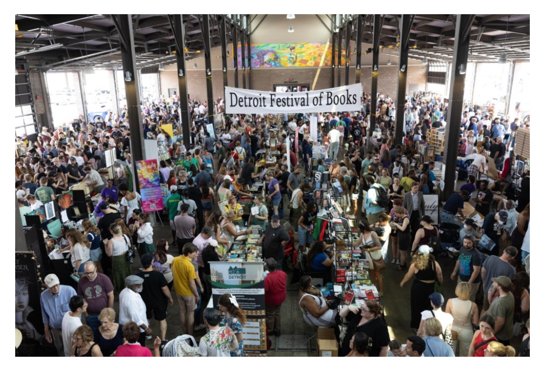
All Together Now ... DETROIT HUSTLES HARDER!

Free, Public Event ~ All, Welcome < <u>https://detroitbookfest.com/</u> >