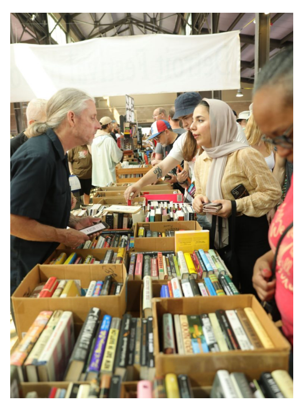
Browsers and Buyers will Bargain! 2024 Detroit Festival of Books

• Music (but, of course, this is Detroit!): Providing light entertainment, the Festival will be visited by street musicians and -- back by popular demand -- seasoned DJs spinning the jams. (Oh, a pity the MC5 is no longer with us, but this heavy-metal Detroit band would steal the show.)